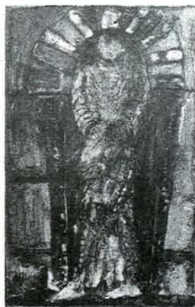
June Wayne Lithograph Hommage d'Autun

The 24 th Annual Los Angeles/IFPDA Fine Print Fair will open in conjunction with the Los Angeles Art Show January 21-25, 2009 at the Los Angeles Convention Center. The Los Angeles/IFPDA Fine