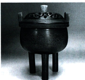
CHINESE BRONZE INLAID INCENSE BURNER.