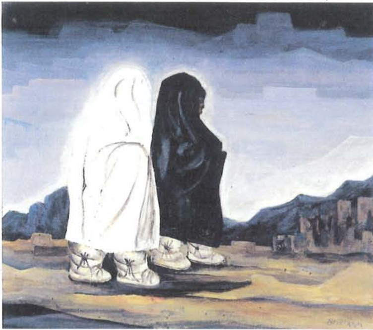
Nedra Matteucci Galleries, Untitled (Pueblo Figures) , oil on canvas, 13¼ x 15¼", by Emil Bisttram