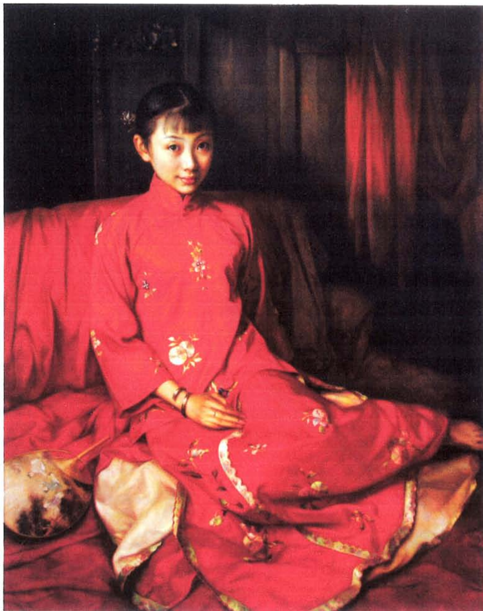
Arcadia Gallery , Symphony in Red , oil on canvas, 58 x 46", by Zhao Kail Lin

Over 15,000 works of art will be available for sale, from paintings, drawings, prints, photographs, video,