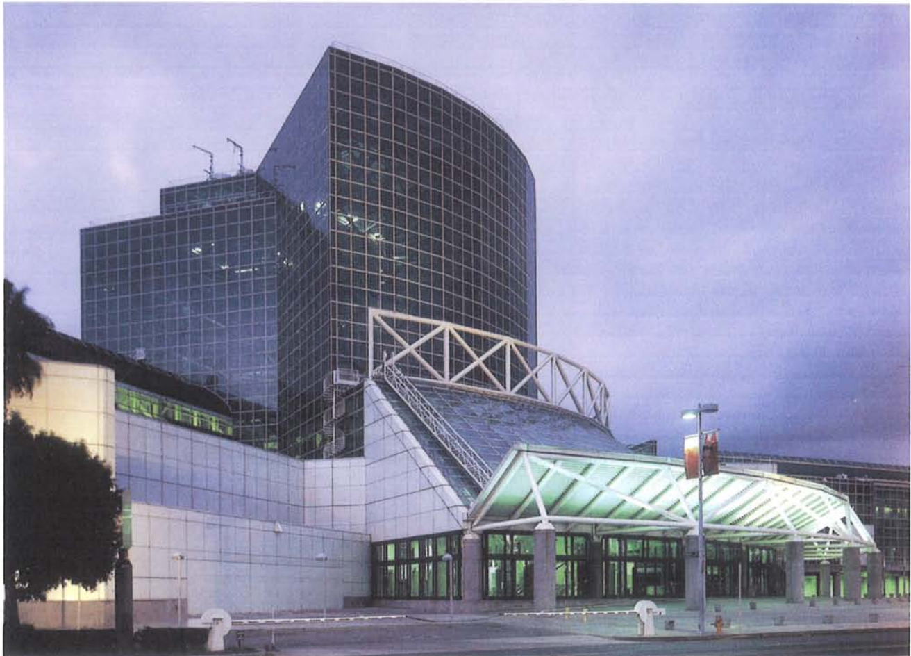
This year will be the show's first to take place in the Los Angeles Convention Center.